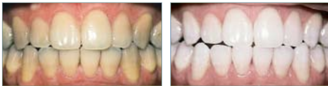
Teeth whitening is the highest-demanded dental procedure for patients aged twenty to fifty.