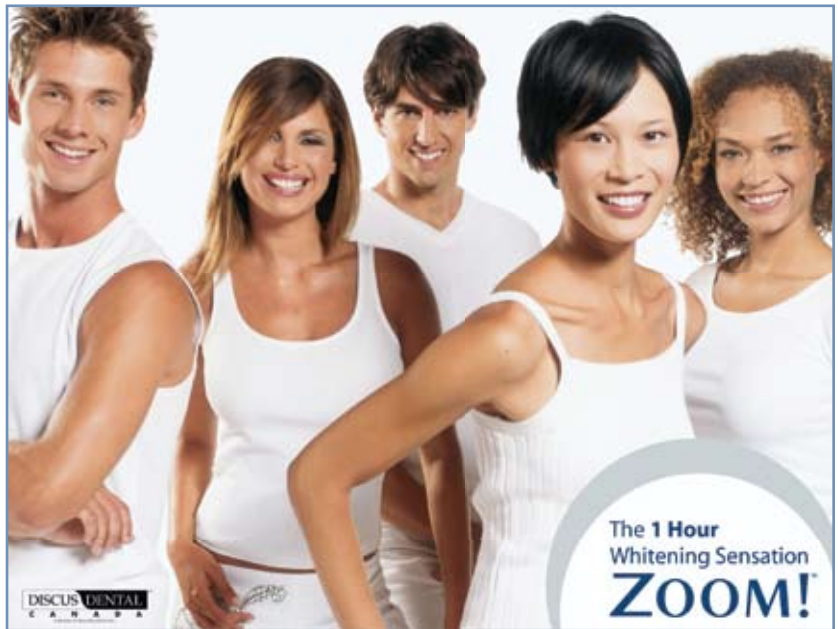
*Age restrictions may apply

age or tetracycline is the culprit. Zoom! Advanced Power could be the answer you've been looking for! Call us today for your personal smile consultation. In only one office visit, your teeth could Zoom! to the top of the charts ... and then some!